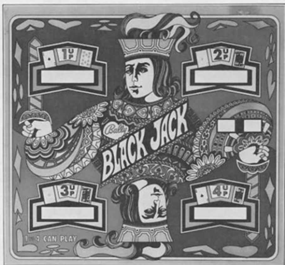
BACK GLASS G-408-33

WHEN ORDERING PART, SPECIFY PART NO. AND NAME OF GAME