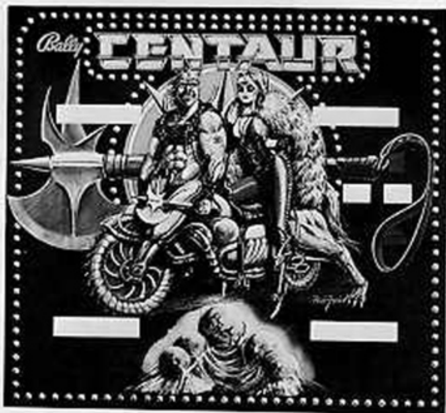
BACK GLASS G-440-20

WHEN ORDERING PART, SPECIFY PART NO. AND NAME OF GAME