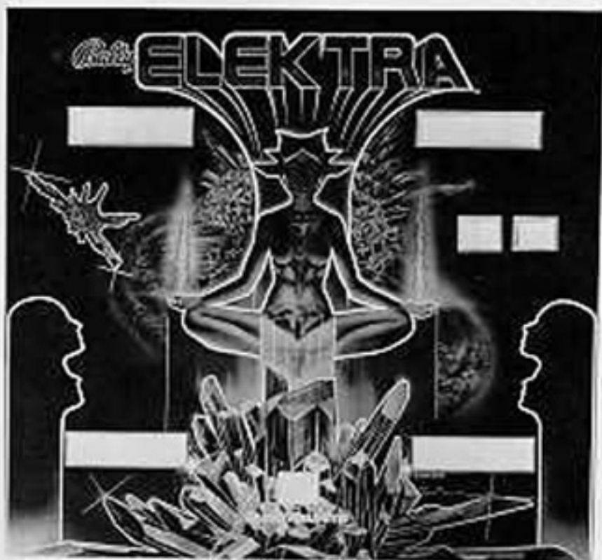
BACK GLASS G-440-21

WHEN ORDERING PART, SPECIFY PART NO. AND NAME OF GAME