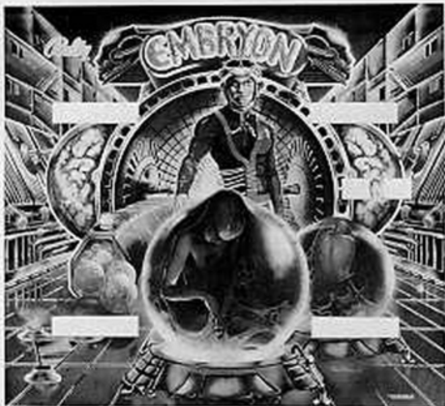
BACKGLASS G 440-16

WHEN ORDERING PART, SPECIFY PART NO. AND NAME OF GAME