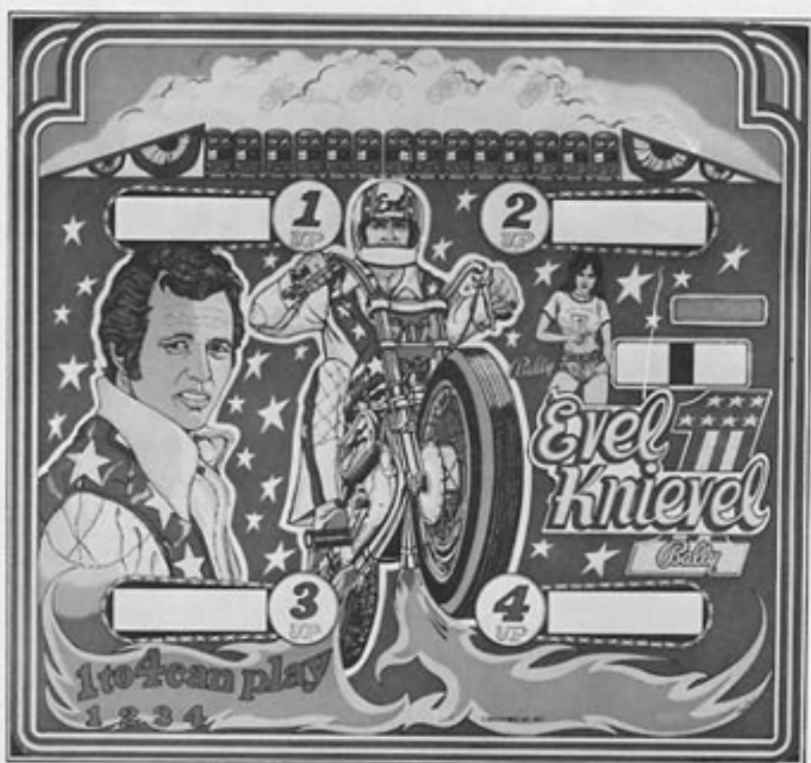
BACK GLASS G-408-25

WHEN ORDERING PART, SPECIFY PART NO. AND NAME OF GAME