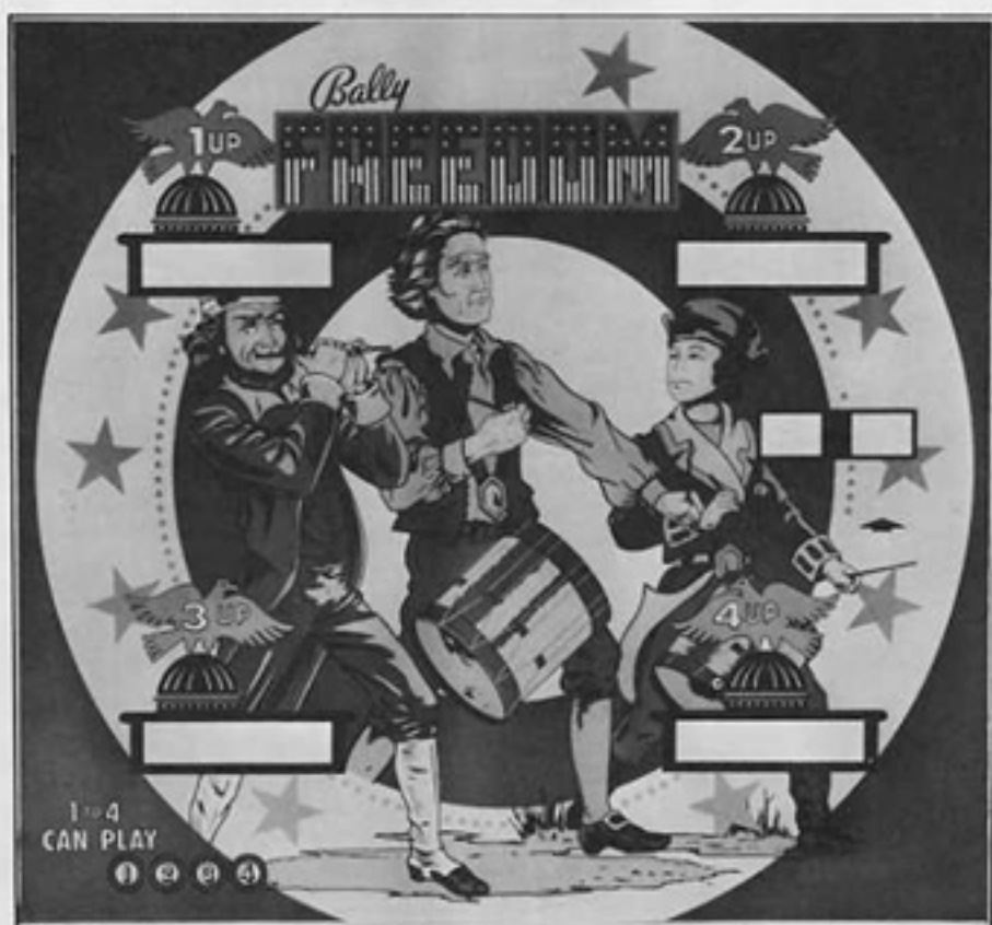
BACK GLASS G-408-21

WHEN ORDERING PART, SPECIFY PART NO. AND NAME OF GAME