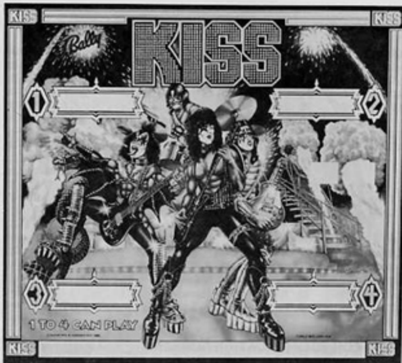
BACK GLASS GT-408-41 (Sold to Germany only)