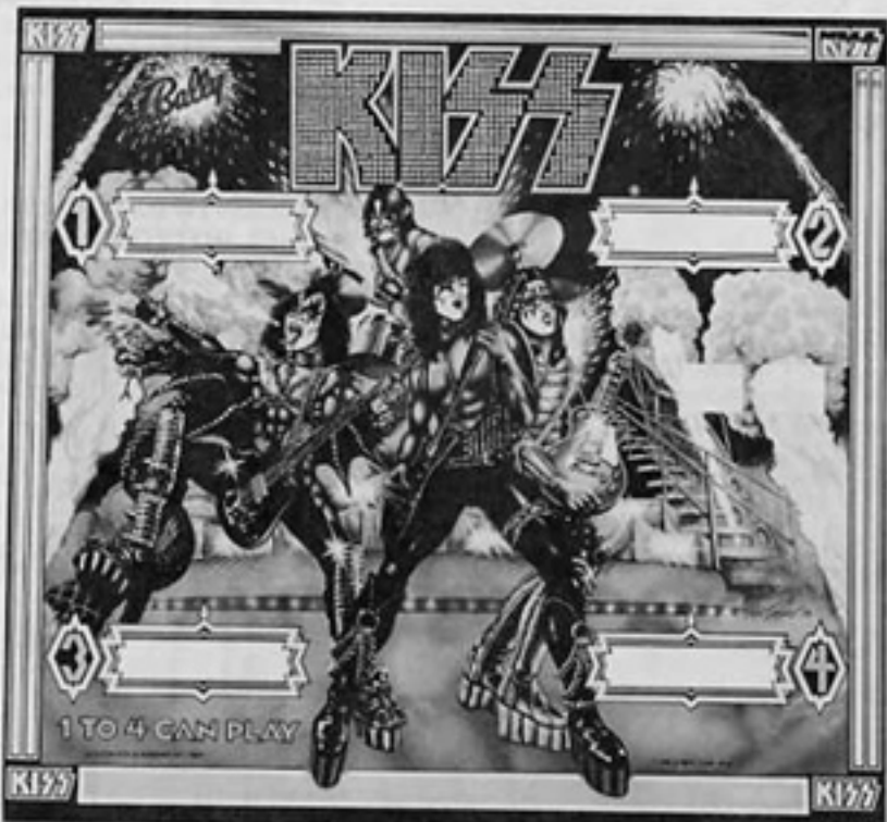
BACK GLASS GT-408-37

WHEN ORDERING PART, SPECIFY PART NO. AND NAME OF GAME