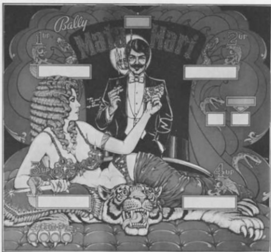
BACK GLASS G-408-30

WHEN ORDERING PART, SPECIFY PART NO. AND NAME OF GAME