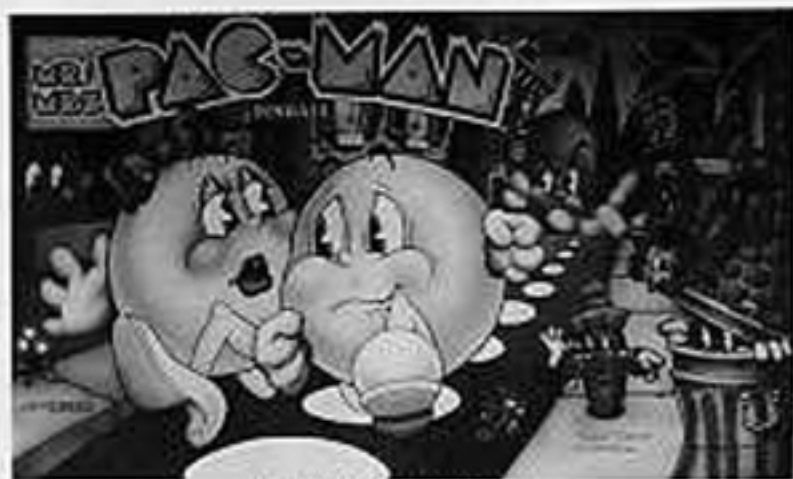
UPPER BACK GLASS G-460-1