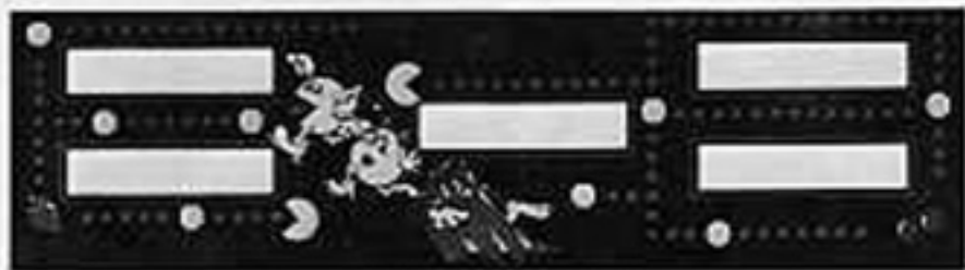
LOWER BACK GLASS G-462-1

WHEN ORDERING PART, SPECIFY PART NO. AND NAME OF GAME