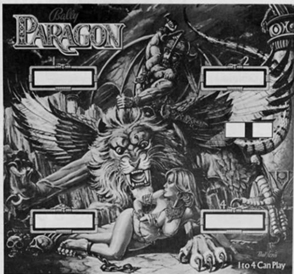
BACK GLASS GT-408-44

WHEN ORDERING PART, SPECIFY PART NO. AND NAME OF GAME