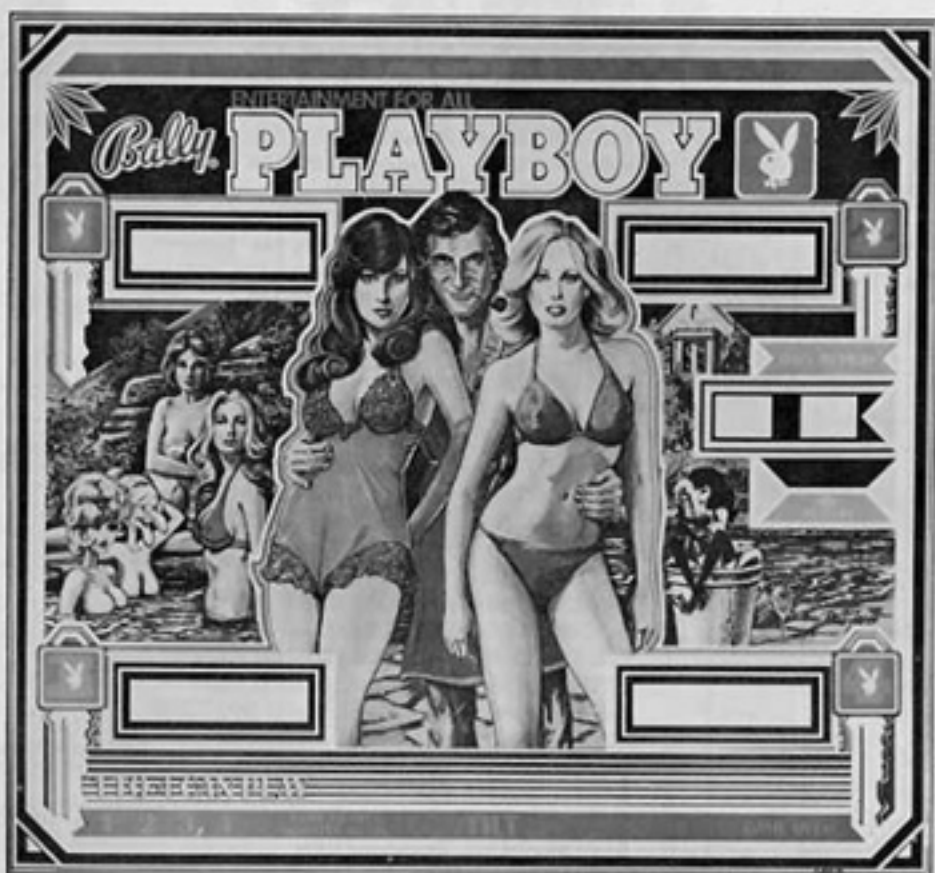
BACK GLASS GT-408-34

WHEN ORDERING PART, SPECIFY PART NO. AND NAME OF GAME