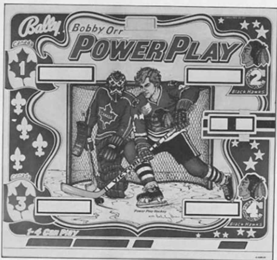
BACK GLASS G-408-29

WHEN ORDERING PART, SPECIFY PART NO. AND NAME OF GAME