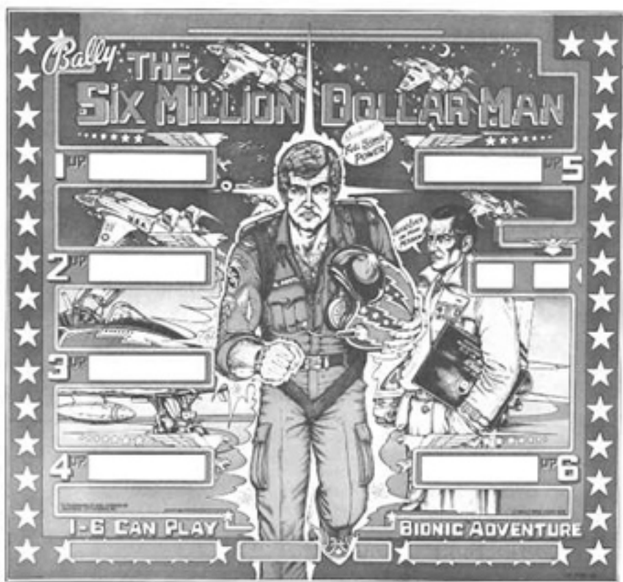
BACK GLASS G-408-32

WHEN ORDERING PART, SPECIFY PART NO. AND NAME OF GAME