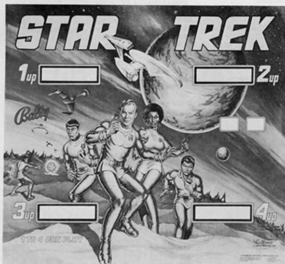
BACK GLASS GT-408-35

WHEN ORDERING PART, SPECIFY PART NO. AND NAME OF GAME