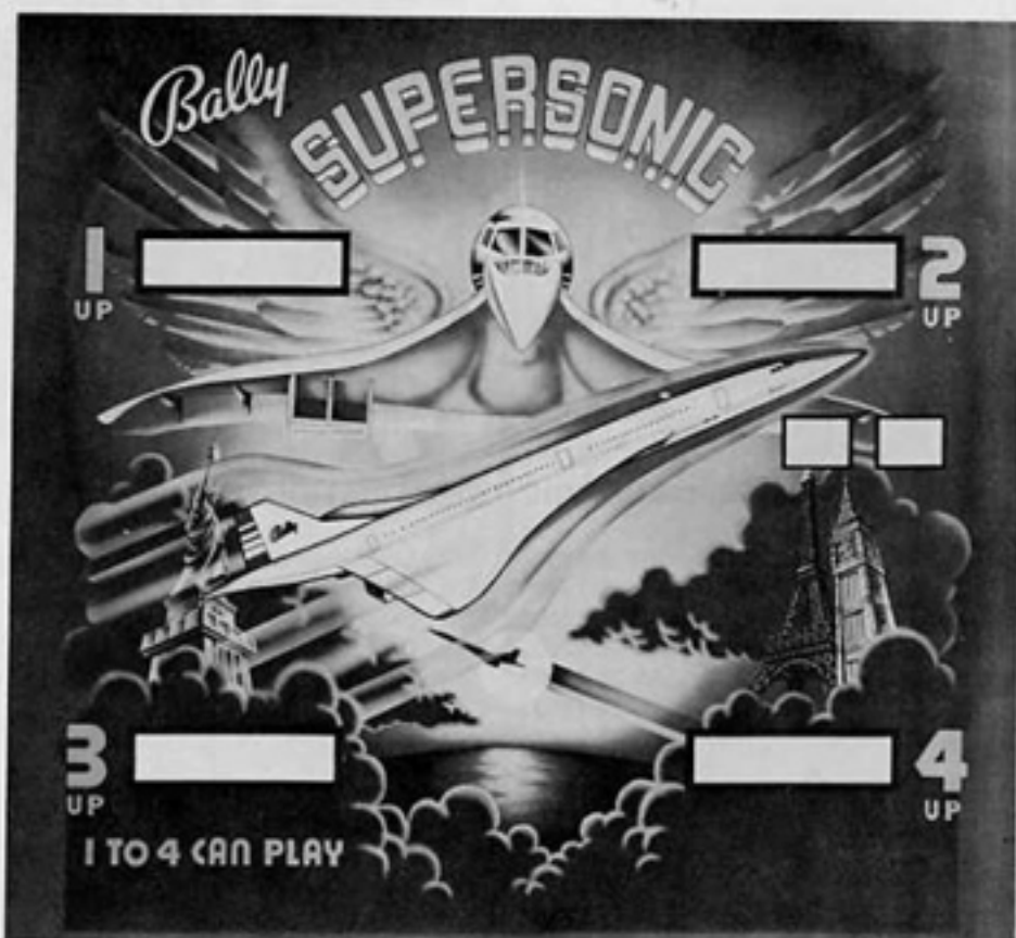
BACK GLASS GT-408-42

WHEN ORDERING PART, SPECIFY PART NO. AND NAME OF GAME